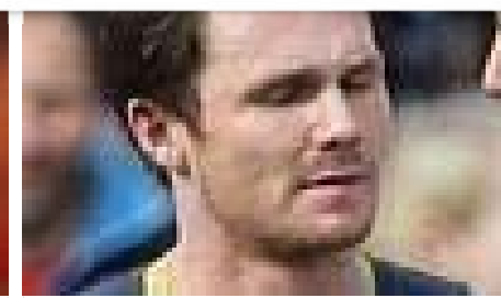
Chat recap: Cats talk Dangerfield trade

When he got home, he fell asleep again while doing homework on the couch.